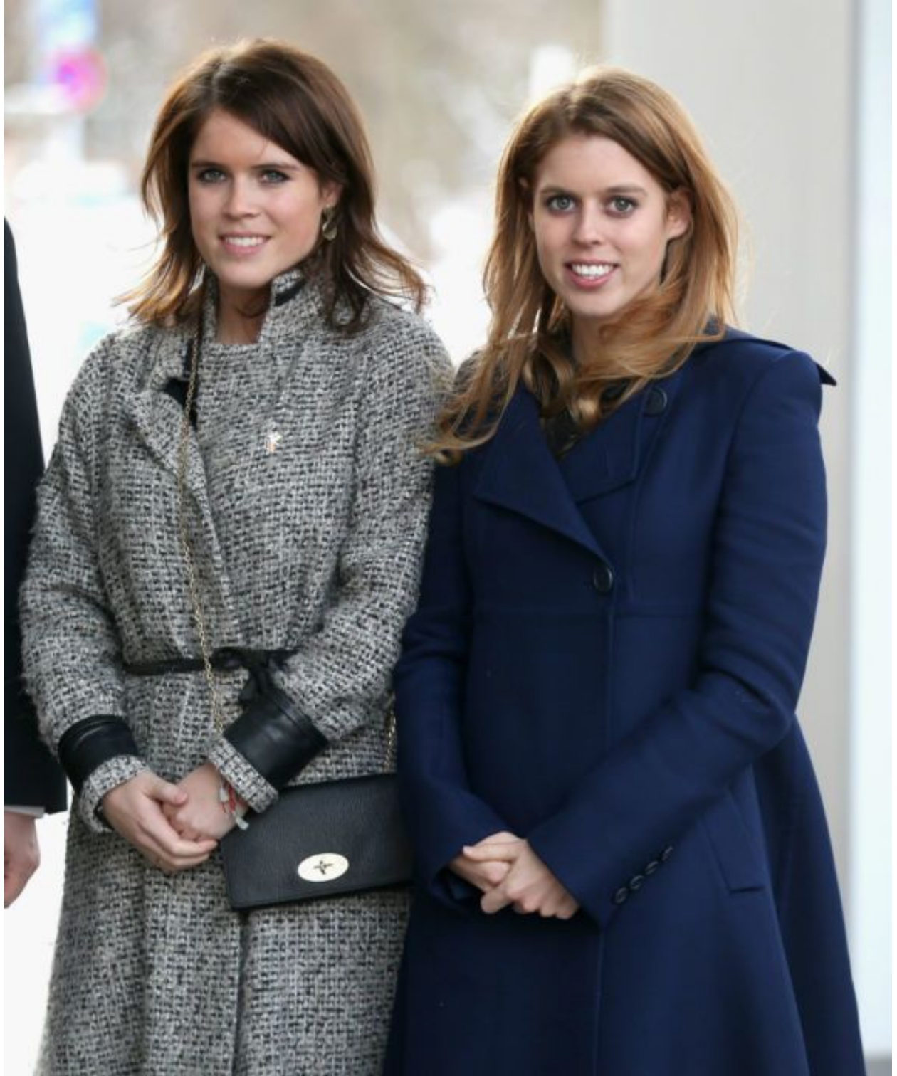
Princess Beatrice and Princess Eugenie were also tested using the golden ratio.